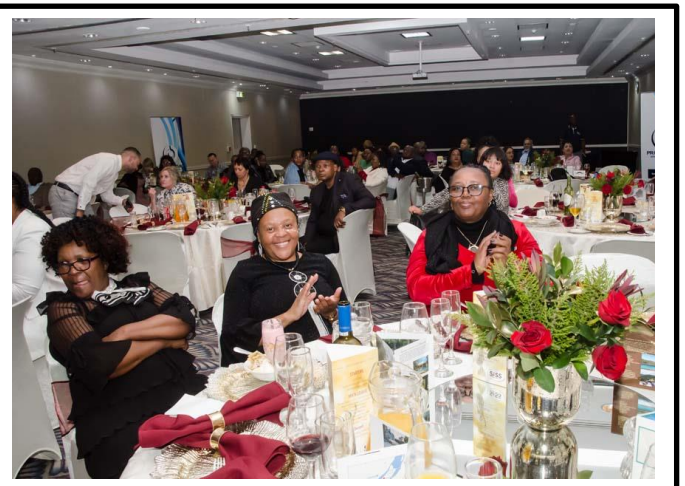
Gala Dinner Extravaganza